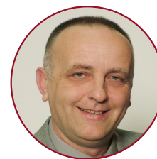
Jordan Minov Institute for Occupational Health of R. North Macedonia, R. North Macedonia