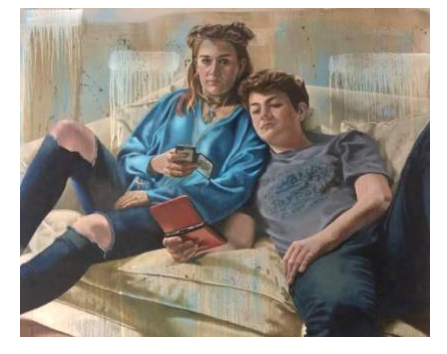
At Home (for now) © Fiona Land Oil on canvas