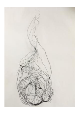
We are All but Part of the Whole ©Felicity Clare Whitehead Black iron wire

All images are ©the artist, please caption accordingly. For hi res images, email <u>londoncp8@outlook.com</u>