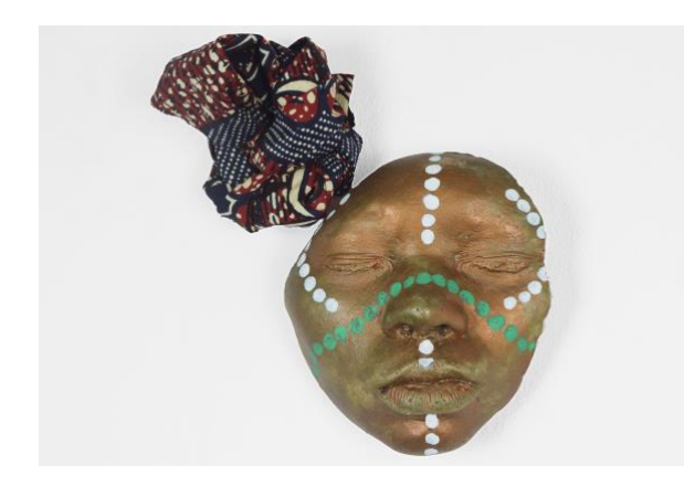
Liberated © Desrie Thomson-George Textiles, plaster, acrylic and bronze powder