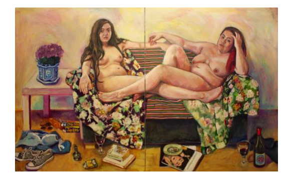
88 (Two Fat Ladies) ©Caroline Wong Acrylic on canvas