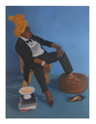
Le Smoking ©Alessandra Bettolo Oil on canvas