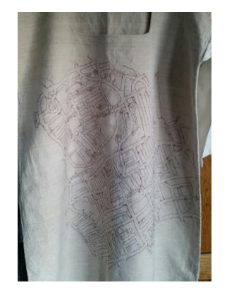
Trousseau 1/13 ©Helen Stone Mixed media with stitch