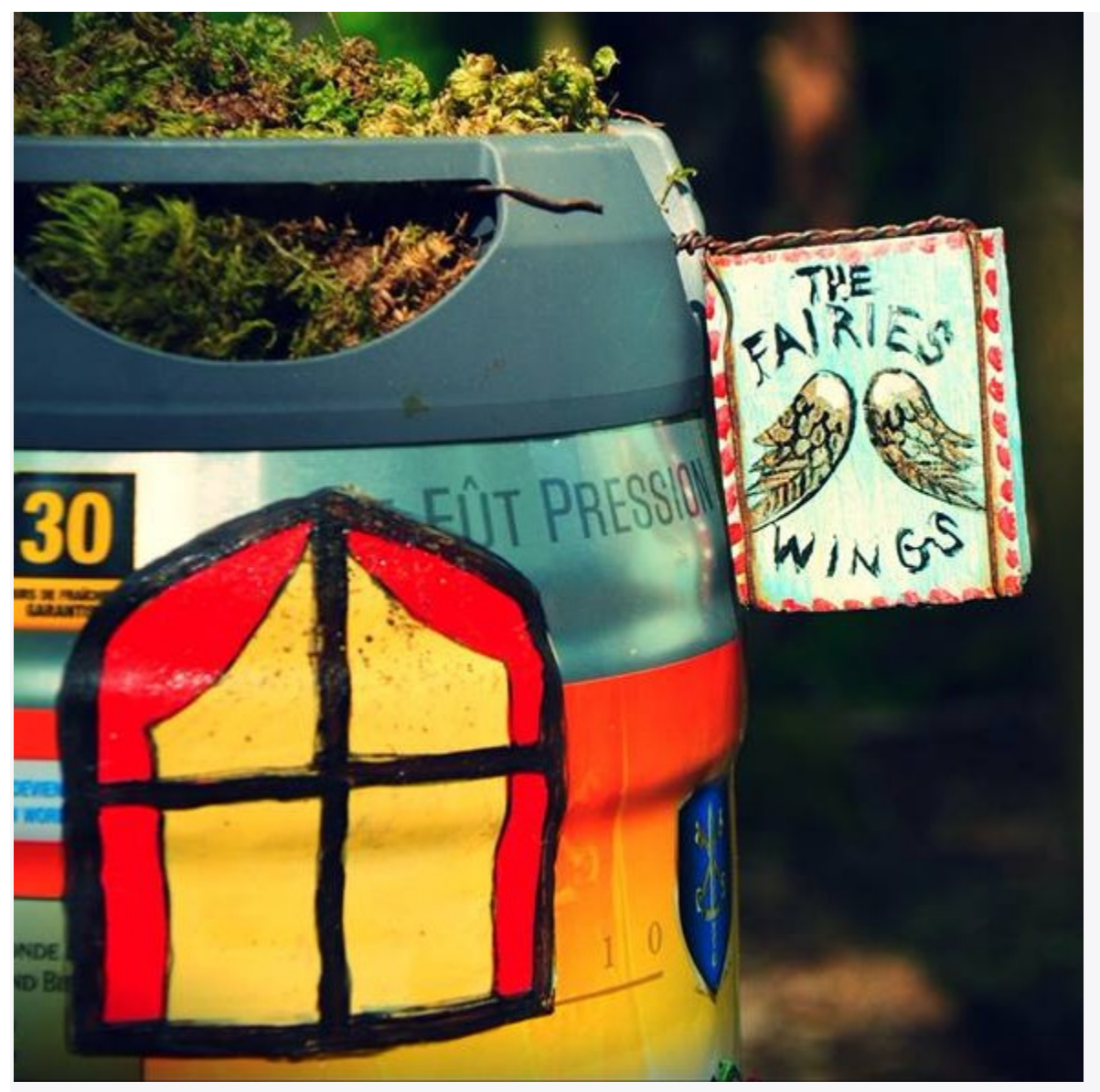
Spring Fairy House Competition

<u>The Green Fairy Trail, Lichfield</u> are inviting you to enter their Spring Fairy House Competition, part of Step into Spring. To enter please read the following guidelines carefully.