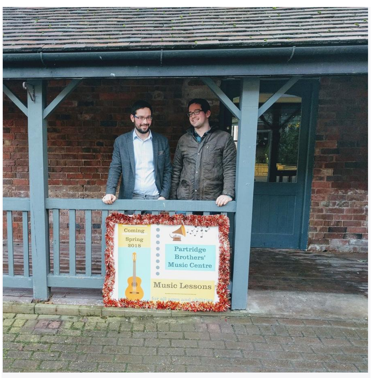
Partridge Brothers Music Centre