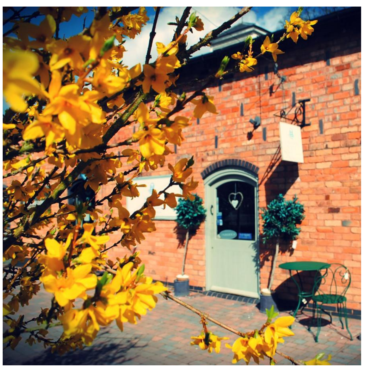
Step into Spring

Join us on 25th March for a free one day event at Heart of the Country Village. There will be artisan stalls, interesting food and drink, and activities