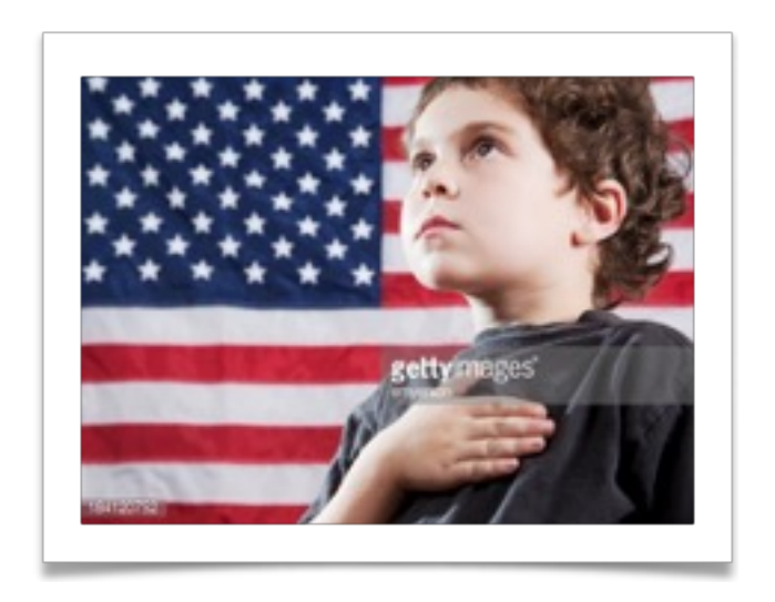
RIGHT HERE: - <a href="http://pmusic.co/rwMPWw">http://pmusic.co/rwMPWw</a>