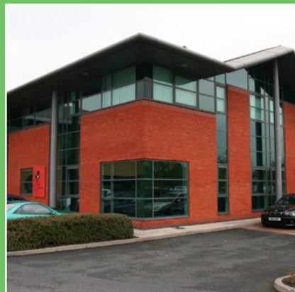
Henshalls' Shrewsbury office