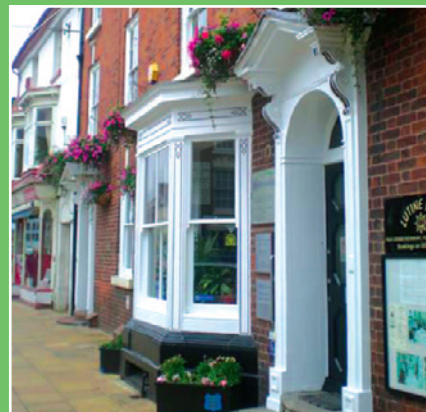
Henshalls' Newport office