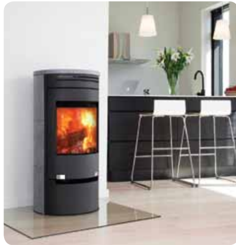
The Aduro with soapstone

Living in a smoke free zone? No problem. There are many models available that use a pre-heat air wash to burn off more of the smoke gases, and are approved for use in smoke free areas.