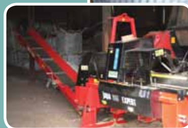
Our new machine

Our wood is a mixture of hardwoods, including Ash, Oak, Chestnut and Beech which has been barn-stored to ensure it is fully seasoned. The wood is stored in vented bulk bags, allowing the wood to breathe and continue to season, and can be collected or delivered free within 10 miles - we're happy to stack them for you too!!