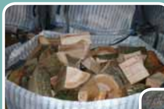
Single bag of processed logs