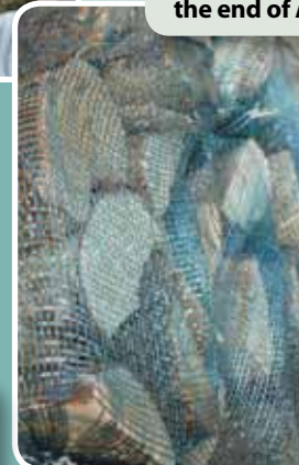
New for 2015: Small netted bags of seasoned split logs (above) and our Jumbo sized cubic litre bag (right)

It is more economical to buy your wood earlier in the year before it is fully seasoned, store it at home and allow the drying to continue through the summer ready for use in the autumn and winter months. Call us now to order yours at a discounted rate for deliveries before the end of August.