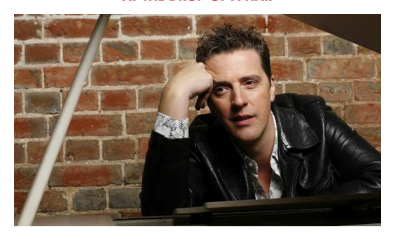
'Spellbinding. Uncanny. Genius.' Times. Independent. Guardian

ANY TUNE. ANY STYLE. AT THE DROP OF A HAT.