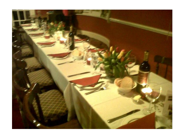
Members will be celebrating Christmas at the Nags Head later in the month.

Day centre for our usual cuppa and a chat or enquiries, from 11am till 12 noon when the Christmas Fair starts further up the alley at St Marys Church Hall.