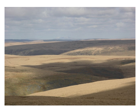
The Cambrian Desert