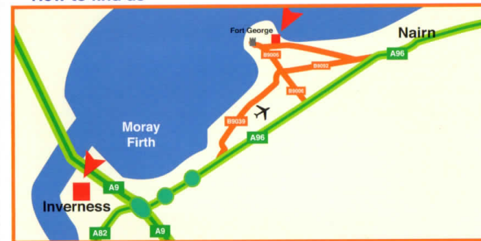
Inverness City Area