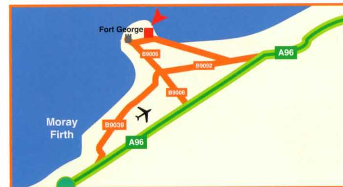
Fort George Site

Self Storage 4 U Ltd Centre Quay, Shore Street Inverness IV1 1SU