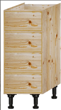
4 Drawer Base Units

300mm £129 400mm £129 500mm £149 600mm £149