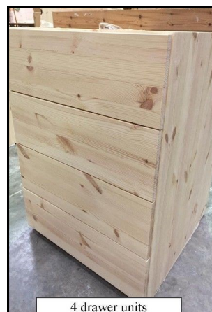
4 drawer units