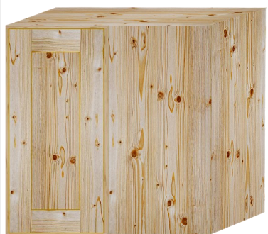
Corner Return Wall Units 600mm £159