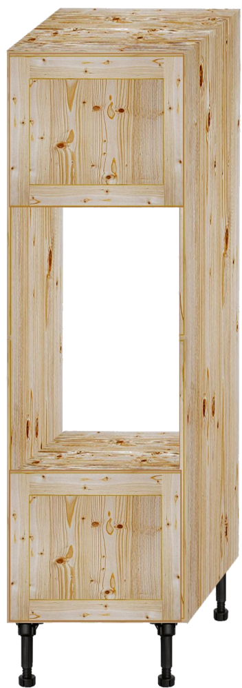
Double Oven Units