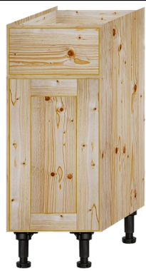
1 Door / 1 Drawer Base Units

300mm £109 400mm £109 500mm £129 600mm £129