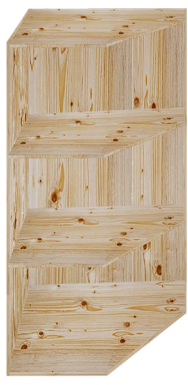
Corner Shelving Units