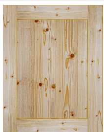
Integrated Doors 450mm £59 600mm £69

All Wall units are 72cm high x 320mm deep