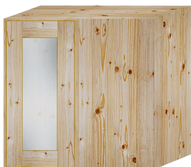
Corner Return Glazed Wall Units 600mm £189