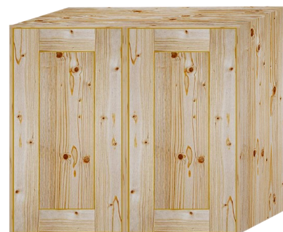
2 Door Wall Units 1000mm £169

300mm £129 400mm £129 500mm £139 600mm £139