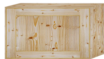
Bridging Unit (300mm high) 600mm £149

All Wall units are 72cm high x 320mm deep