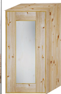
1 Door Glazed Wall Units

300mm £99 400mm £99 500mm £109 600mm £109