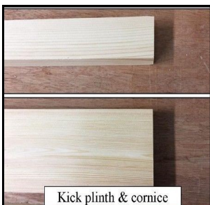
Kick plinth & cornice