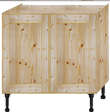
2 Door Base Units

All base units are 72cm high (86cm high including adjustable legs) x 595mm deep