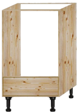
Cooker Housing Base Units