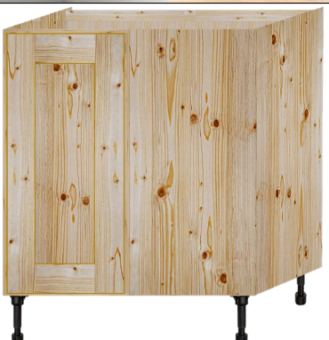
Corner Return Units