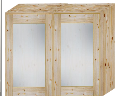
2 Door Glazed Units 1000mm £219