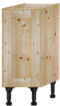
1 Door Base Units

300mm £109 400mm £109 500mm £129 600mm £129