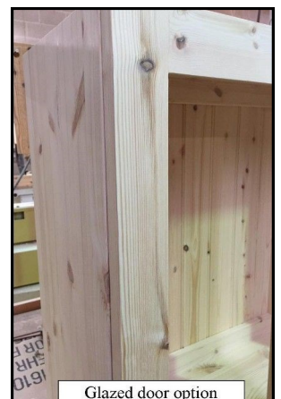
Glazed door option