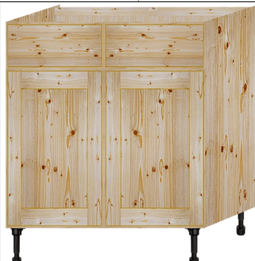
2 Door / 2 Drawer Base Units