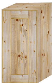
1 Door Wall Units

300mm £99 400mm £99 500mm £109 600mm £109