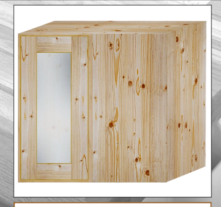
Corner Return Glazed Wall Units 600mm £165