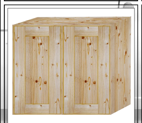
2 Door Wall Units 1000mm £149

300mm £125 400mm £125 500mm £135 600mm £135