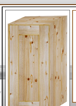
1 Door Wall Units