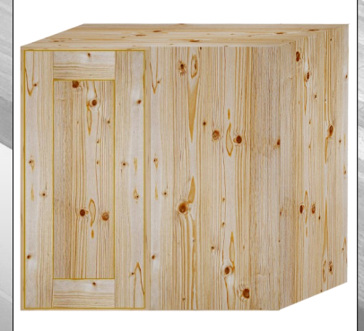
Corner Return Wall Units 600mm £139