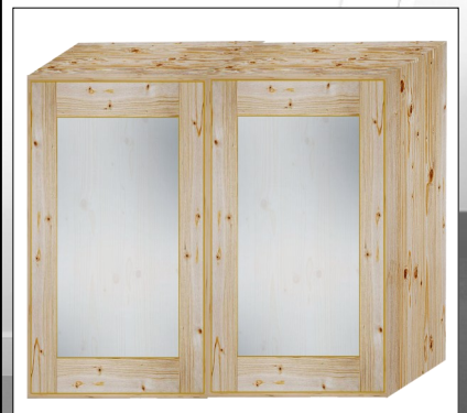
2 Door Glazed Units 1000mm £179