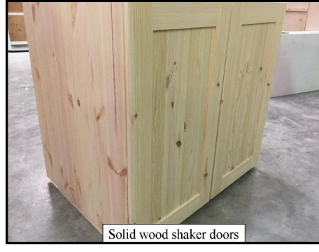
Bespoke Sizes Available on all units