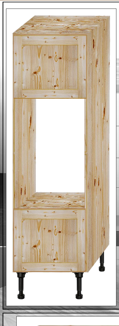
Double Oven Units