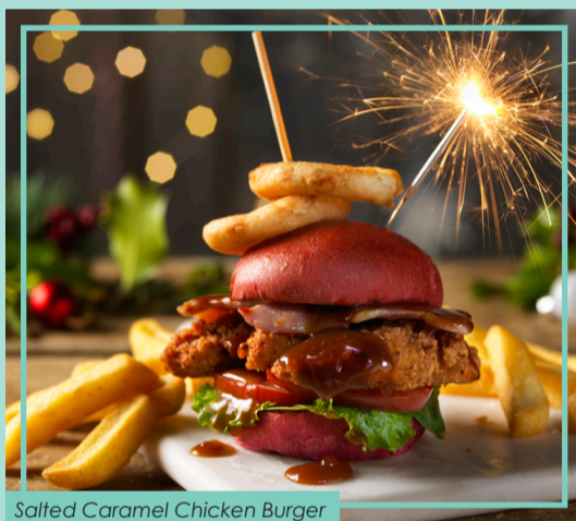
Salted Caramel Chicken Burger

PIGGIN' SUPPER Our take on Christmas sausage and mash! 8 pigs in blankets served on a bed of mashed potato smothered in gravy. to share for only £3.45