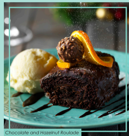
Chocolate and Hazelnut Roulade