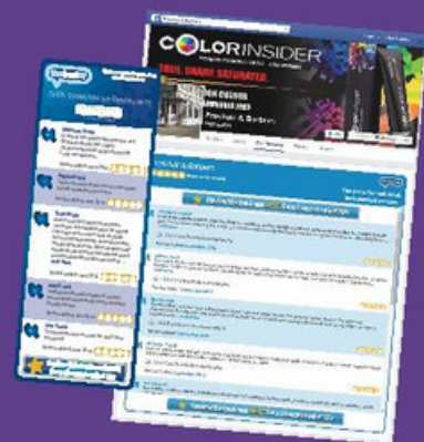
Website & Facebook Reviews Facility

Talk to us today about showcasing your business as the best in your area