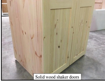
Bespoke Sizes Available on all units